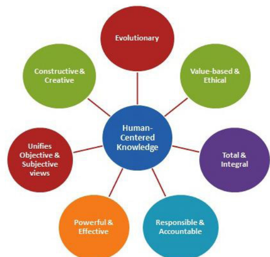
Figure 2: Reliable Knowing

Rather than distinguish itself by specializing in a particular set of disciplines, issues or geographical area, the framework formulated a comprehensive approach and integrated perspective of knowledge inclusive of all disciplinary perspectives and applicable to social problems and opportunities in all fields.